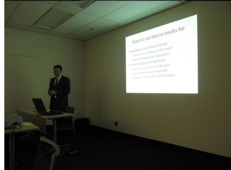
2011 Transportation Boot Camp