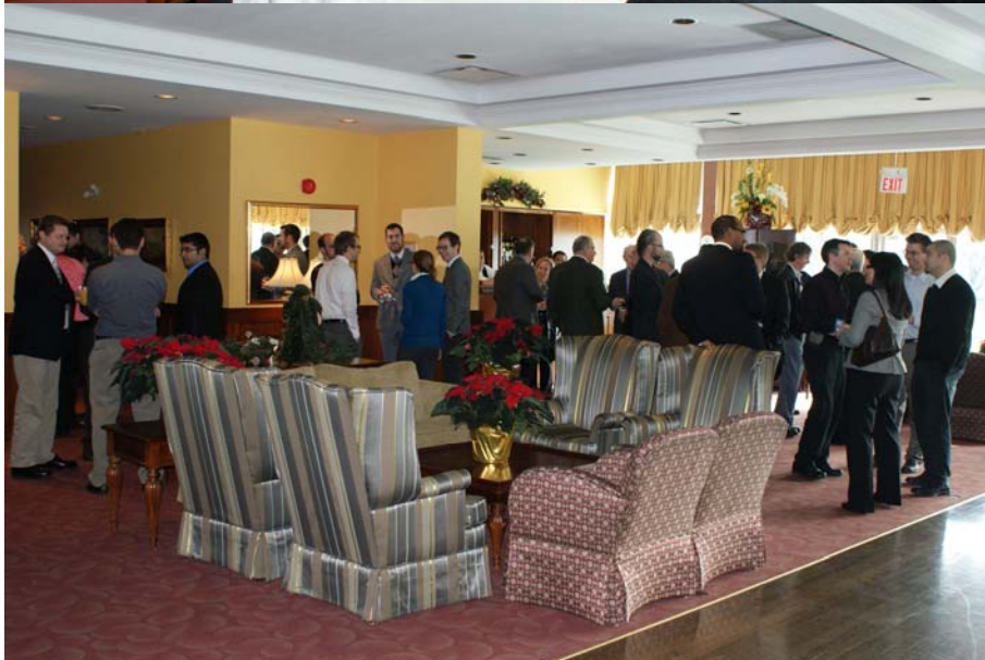
2010 Annual General Meeting