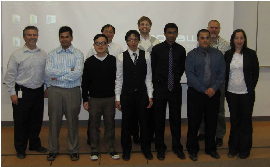
The 2011 Joint Section ITE Student Presentation Competition Participants.