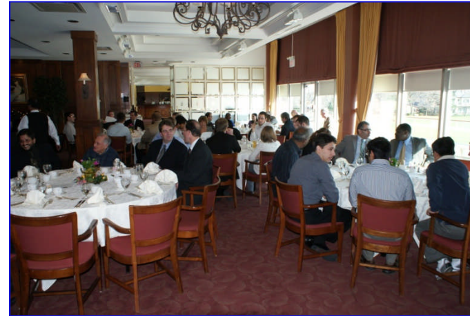
2009 Annual General Meeting

The results show a fascinating picture, benchmarking Canadian cities against each other as well as against other world cities. The difference between the Mobility Index and other 'league tables' is that Mobility Index measures are related to a defined end-state – so they are able to put forward proposed pathways to Complete Mobility using best practice examples from other cities – if that is where the city in question wants to be!