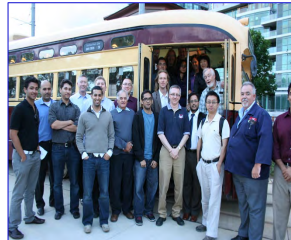
2010 Downtown TTC Streetcar Tour

On Wednesday, June 16, 2010, the Toronto Section hosted an evening downtown streetcar tour with the tour that took a place on one of TTC's historic PCC cars.