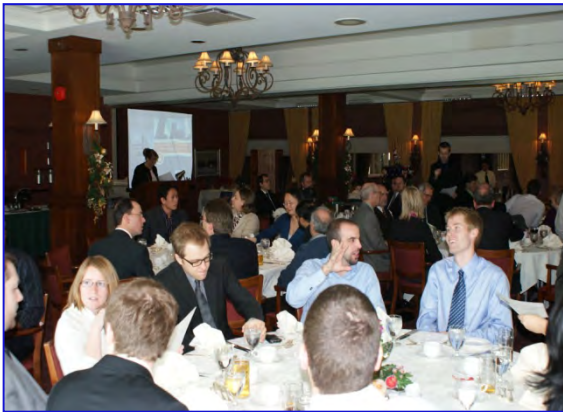
2009 Annual General Meeting