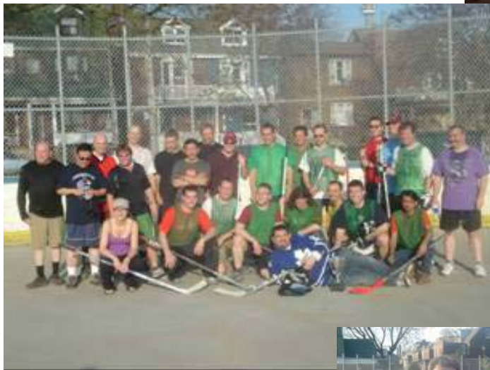
Hockey Challenge Participants