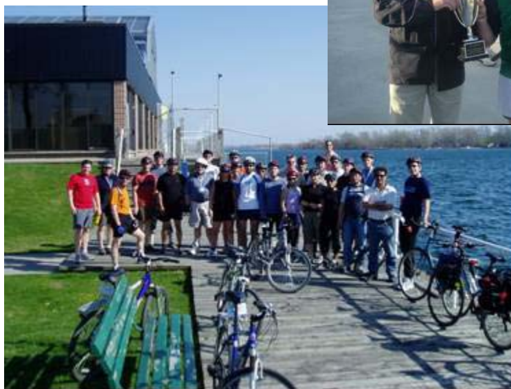
Bicycle Tour Participants